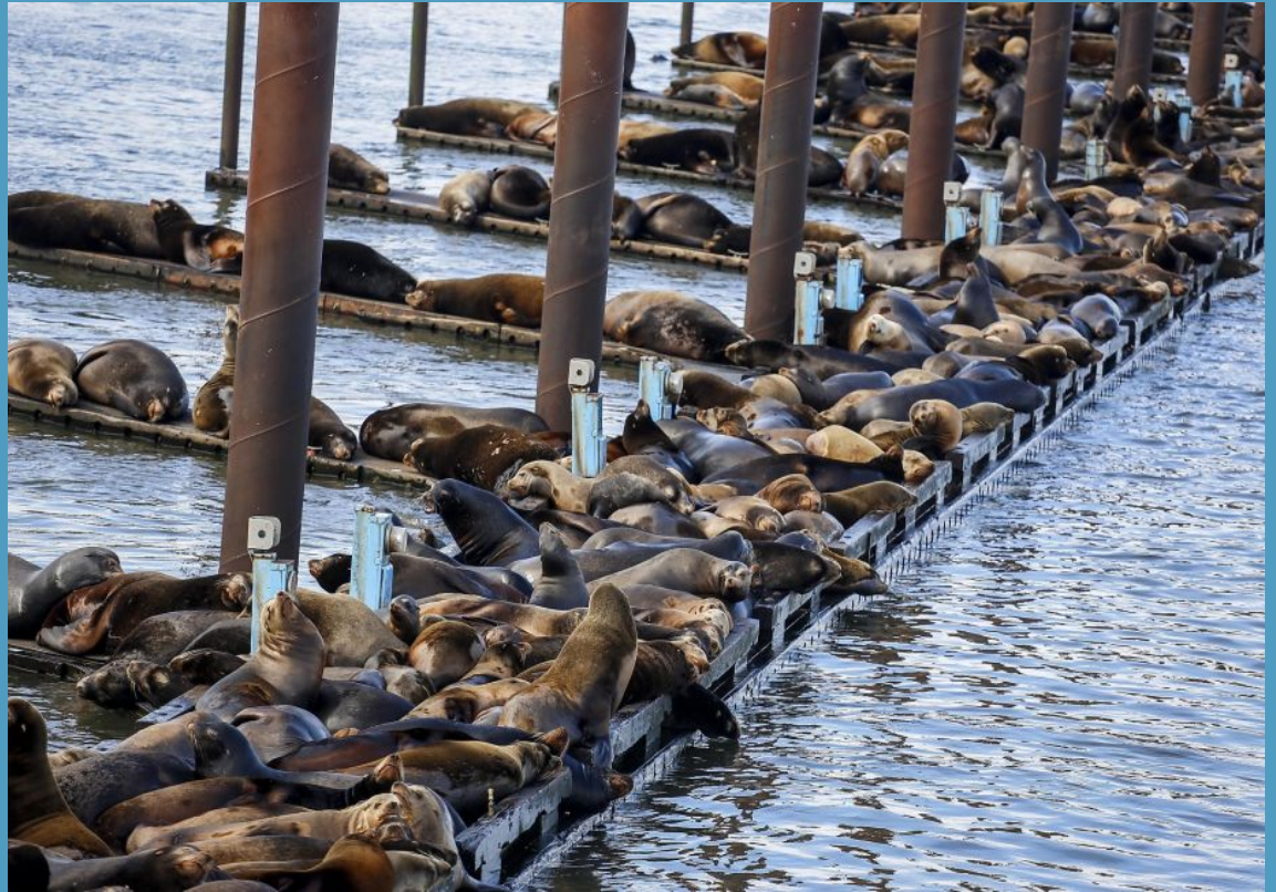
Water & Electrical