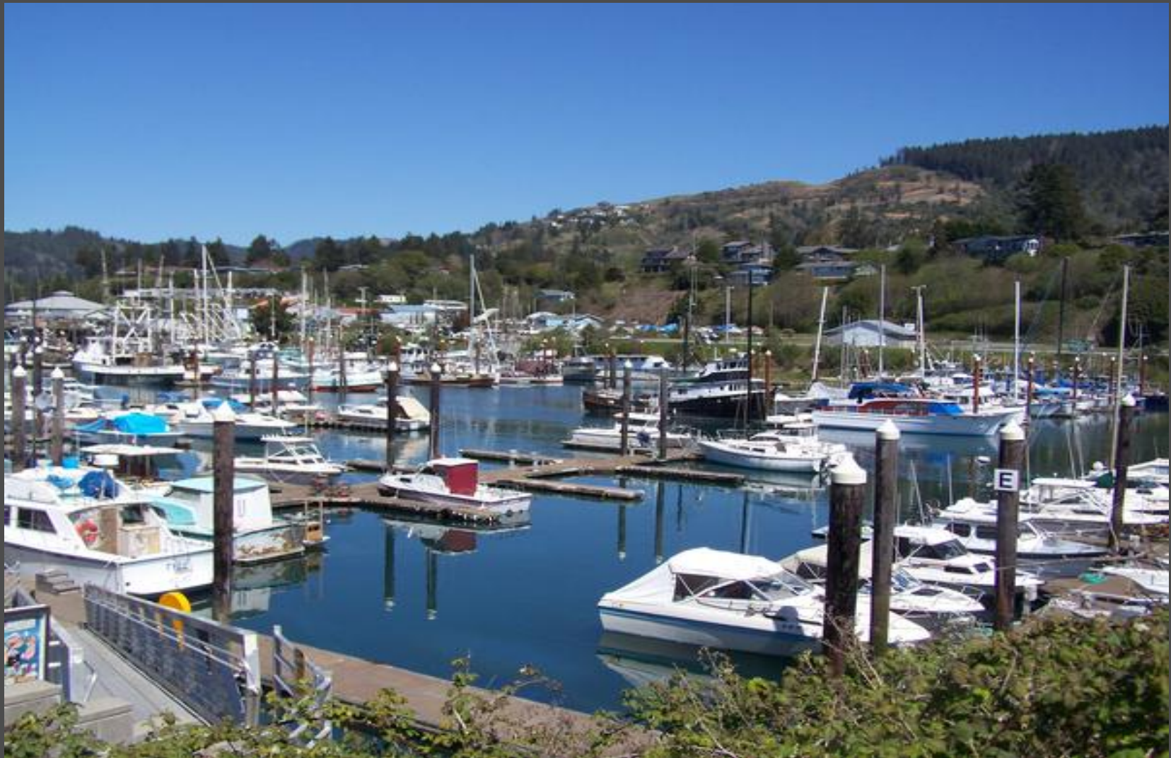
Port of Brookings Harbor