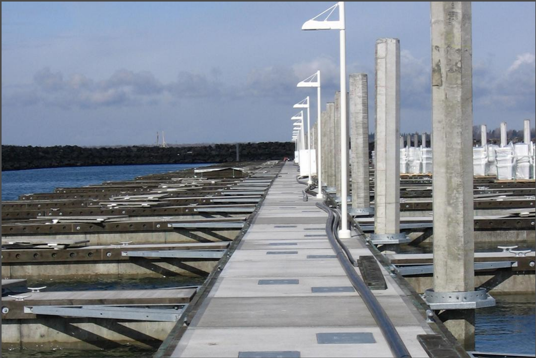
Port of Bellingham Squalicum Harbor