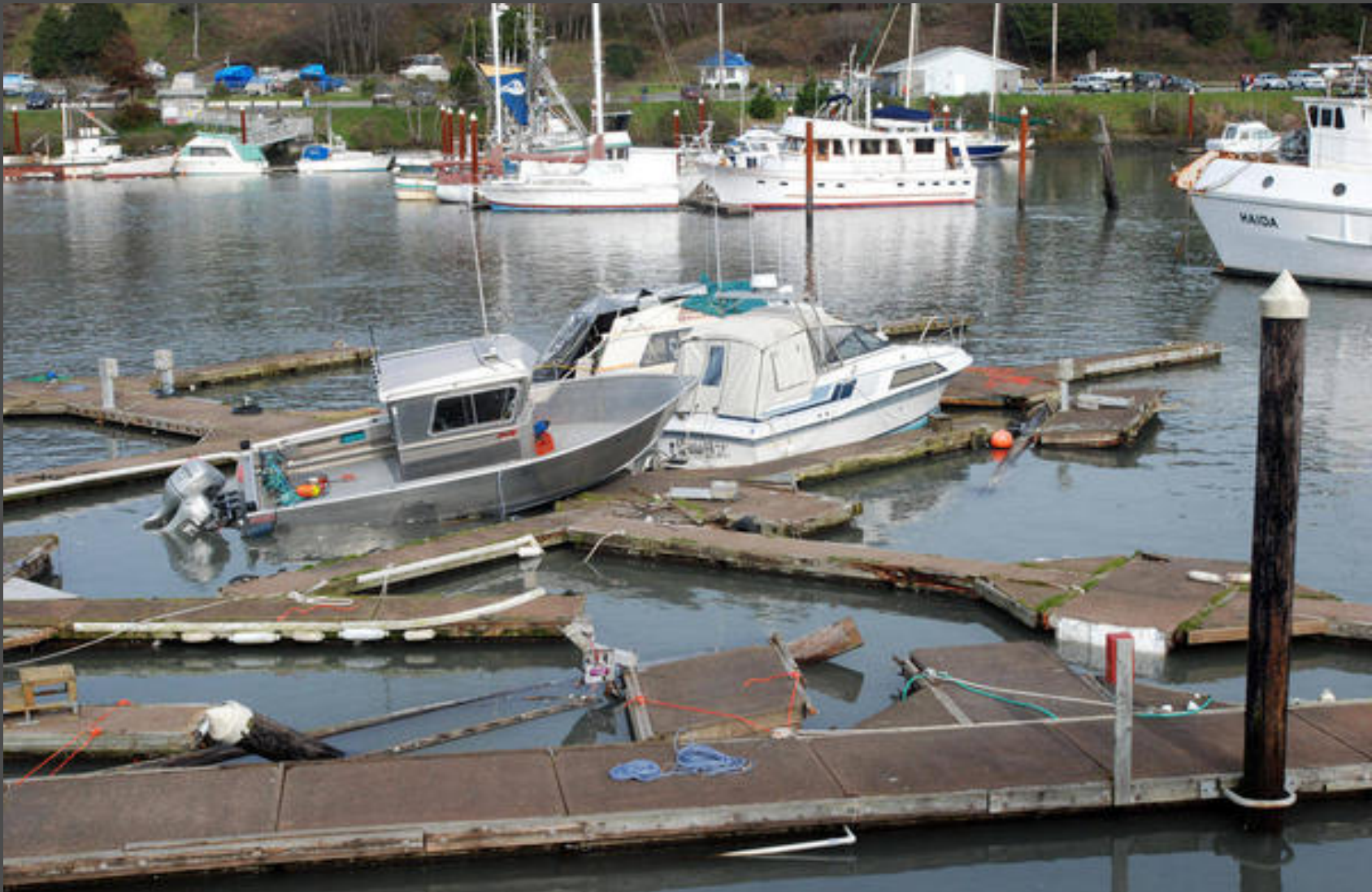
Port of Brookings Harbor