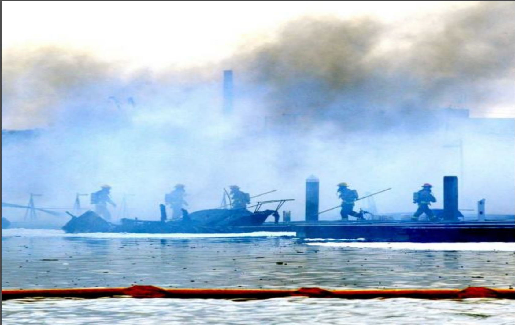
Port of Bellingham Squaticum Harbor