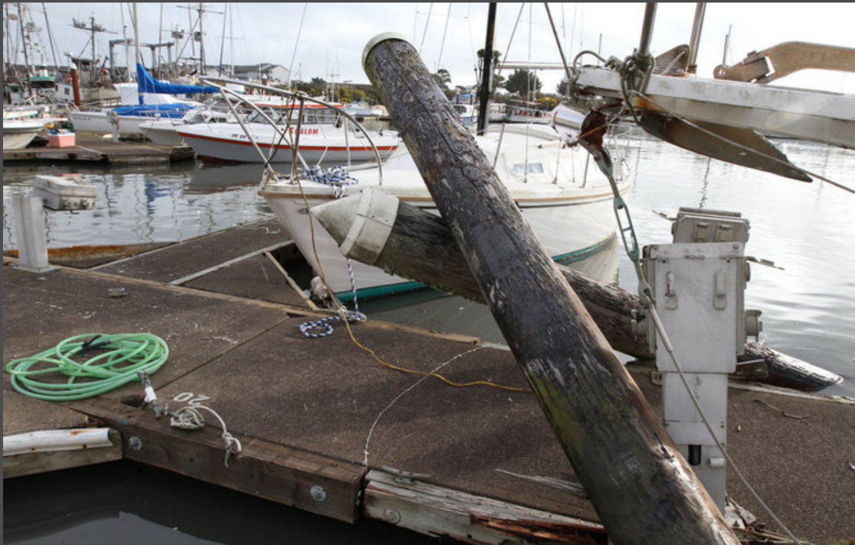
Port of Brookings Harbor